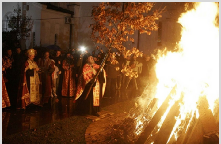
A Badnjak Bonfire outside the Church of St Sava in Belgrade, via Wikimedia Commons

Reference: https://www.whychristmas.com/