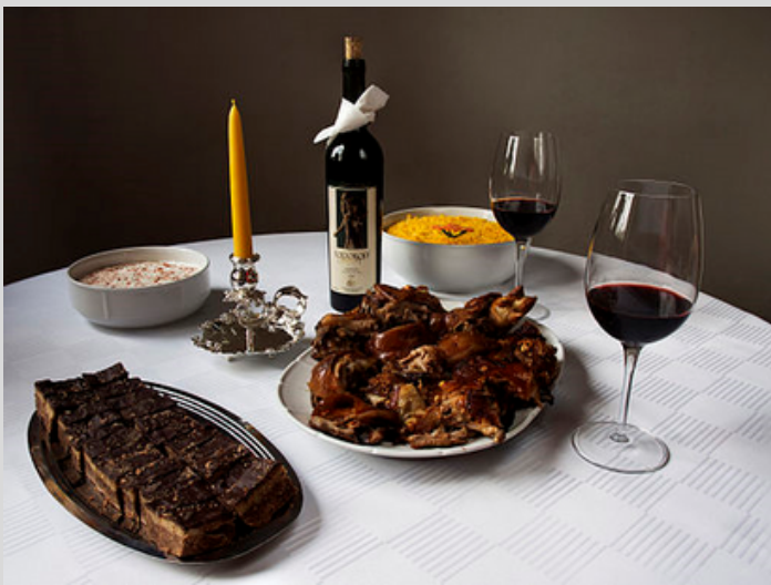
Serbian Christmas Meal

There are sometimes large bonfires outside churches where oak branches and Badnjak are burnt.